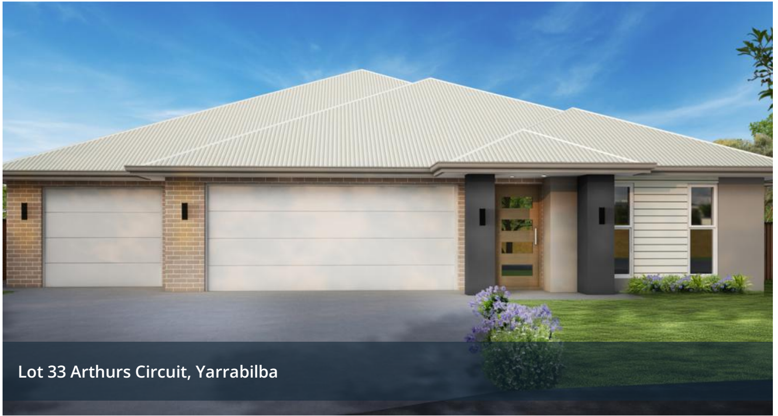
Lot 33 Arthurs Circuit, Yarrabilba