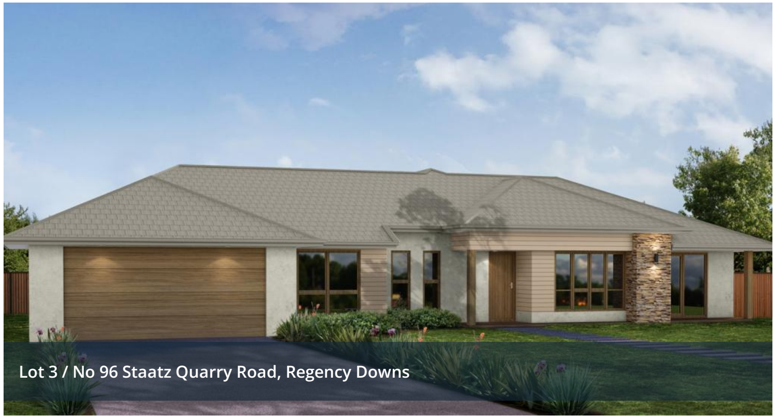
Lot 3 / No 96 Staatz Quarry Road, Regency Downs