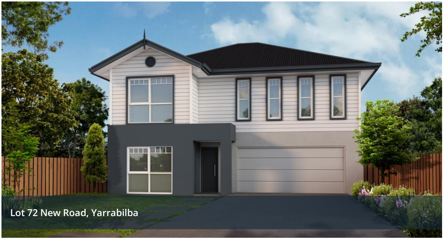
Lot 72 New Road, Yarrabilba