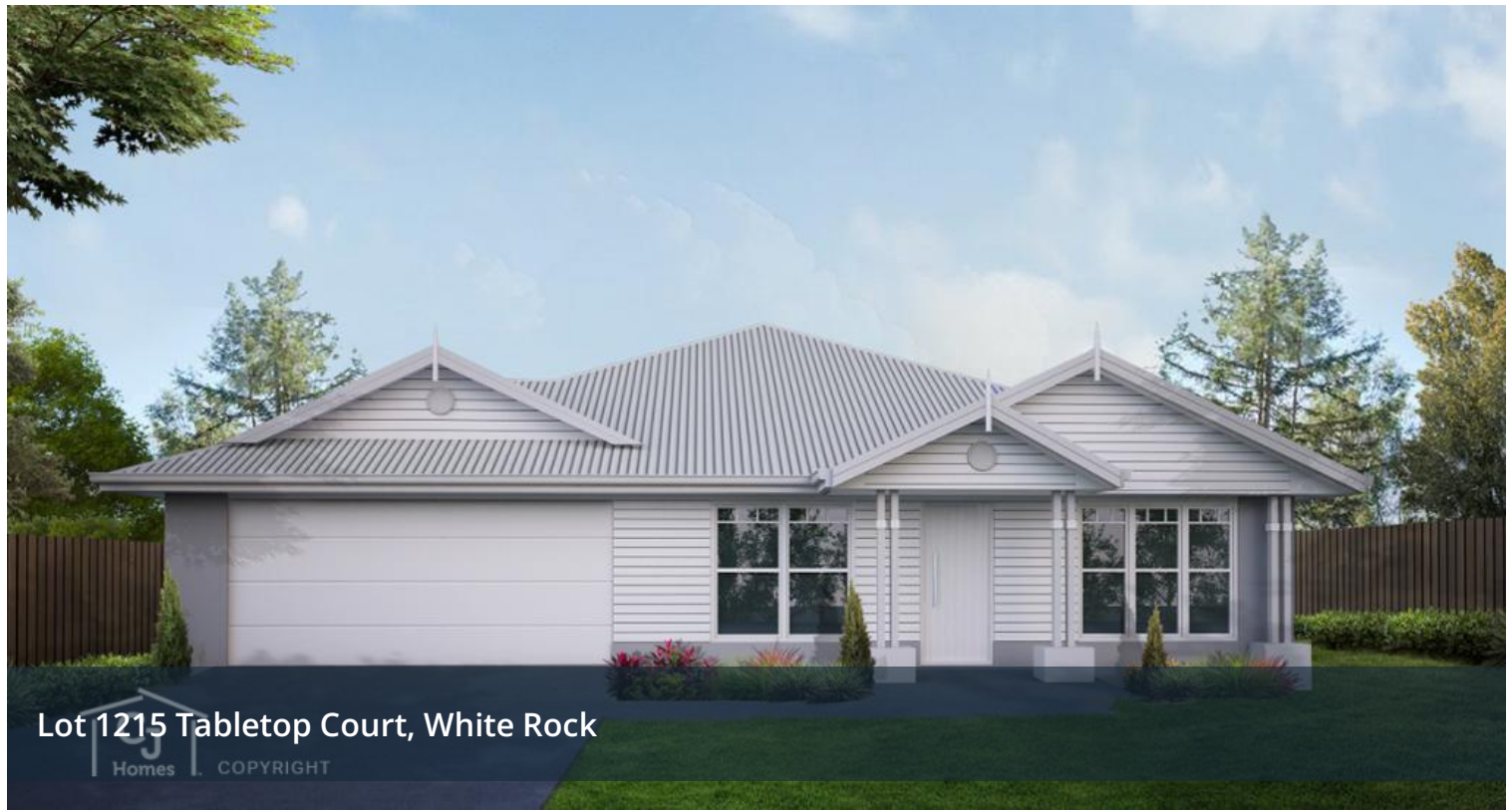
Lot 1215 Tabletop Court, White Rock