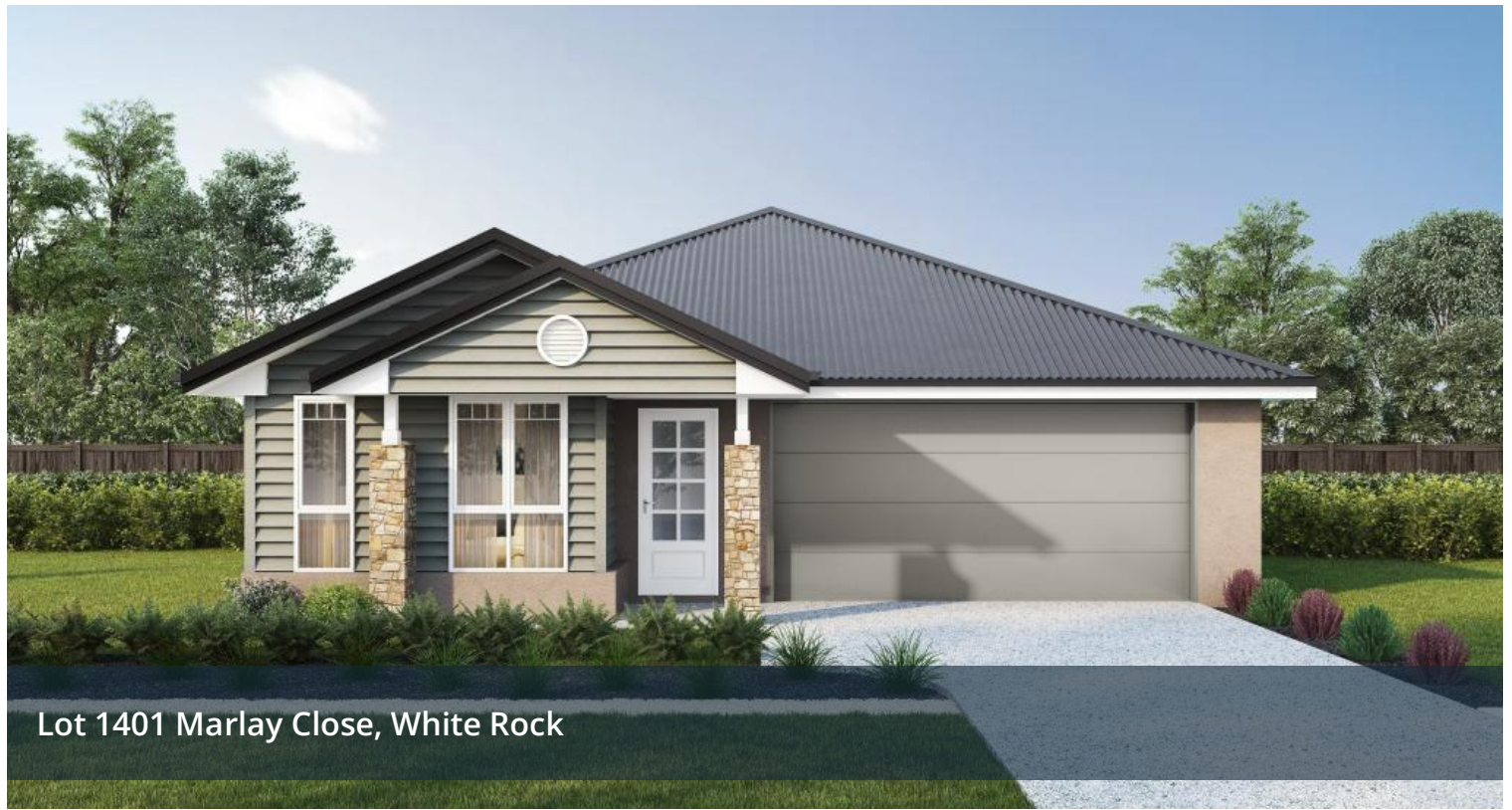
Lot 1401 Marlay Close, White Rock