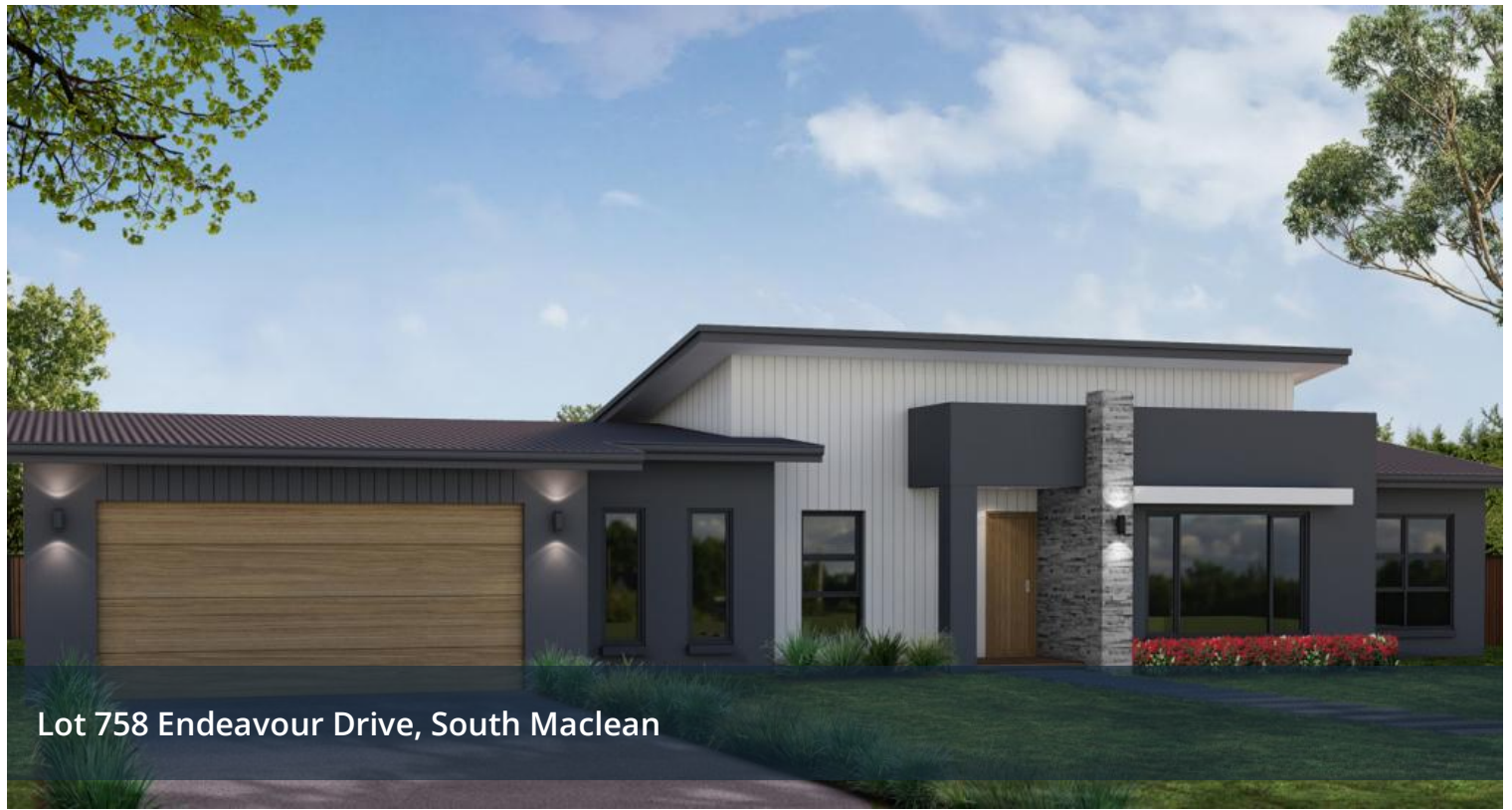
Lot 758 Endeavour Drive, South Maclean