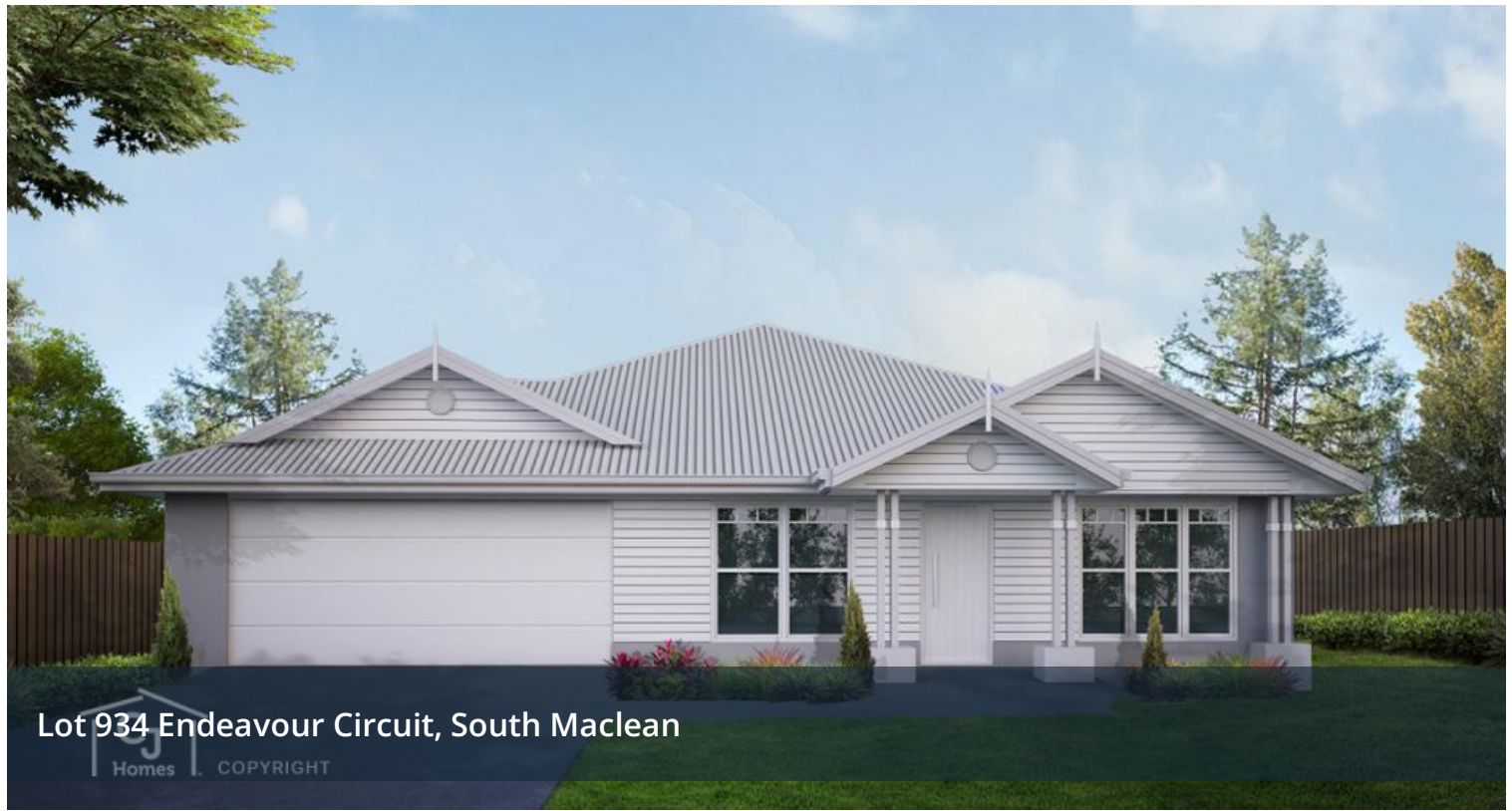
Lot 934 Endeavour Circuit, South Maclean