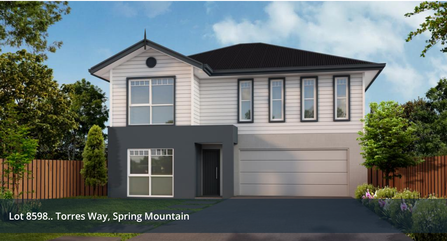
Lot 8598.. Torres Way, Spring Mountain