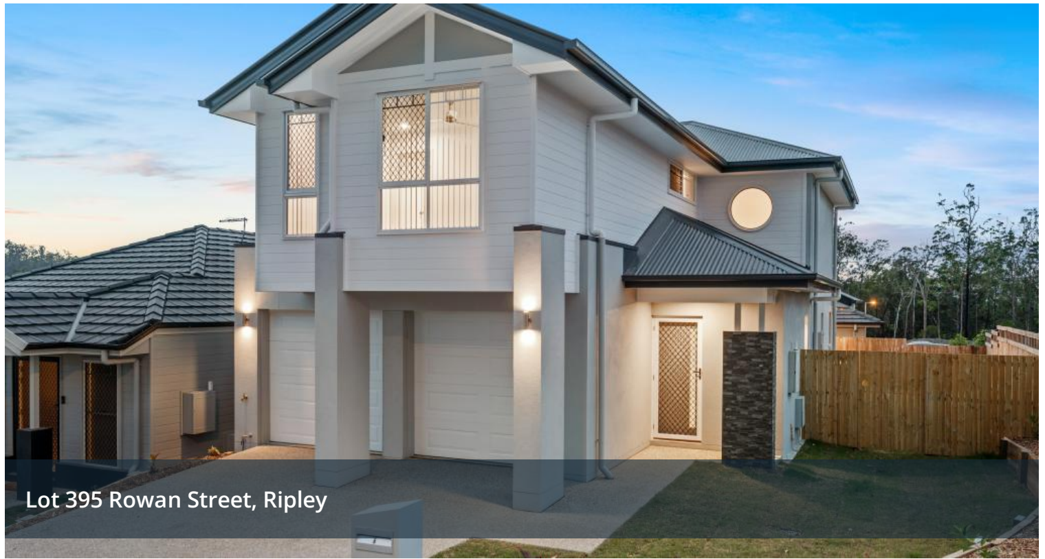
Lot 395 Rowan Street, Ripley