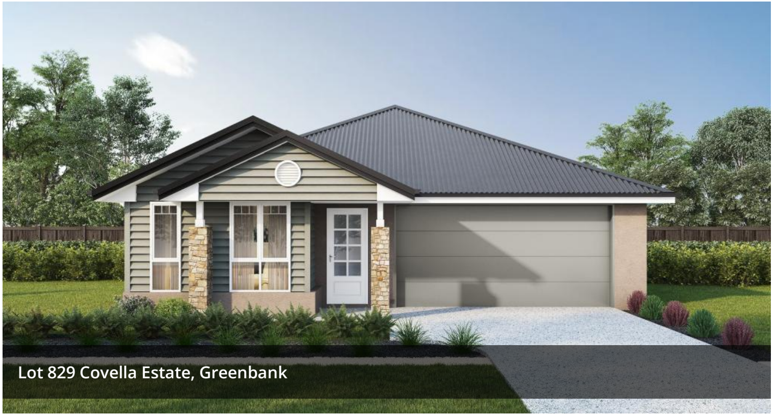
Lot 829 Covella Estate, Greenbank