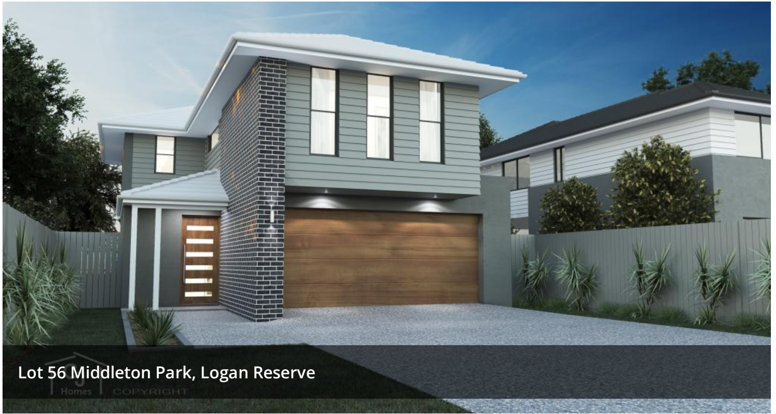
Lot 56 Middleton Park, Logan Reserve