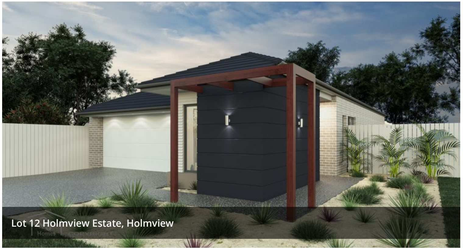
Lot 12 Holmview Estate, Holmview