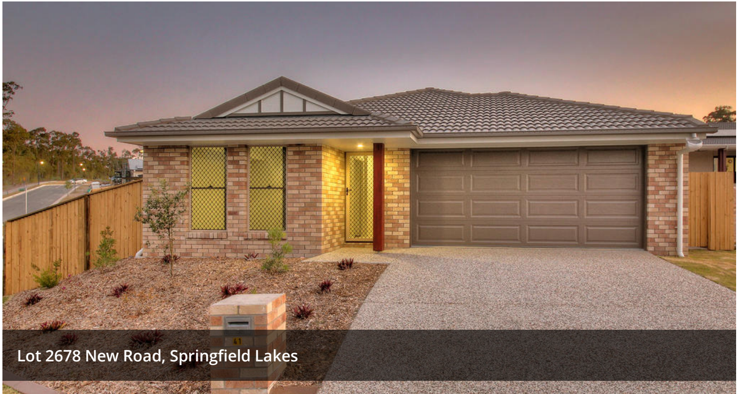
Lot 2678 New Road, Springfield Lakes