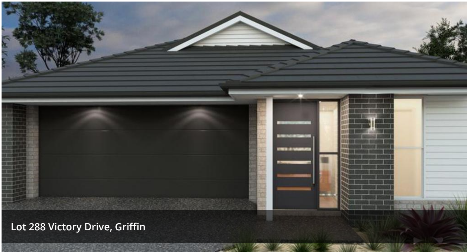
Lot 288 Victory Drive, Griffin